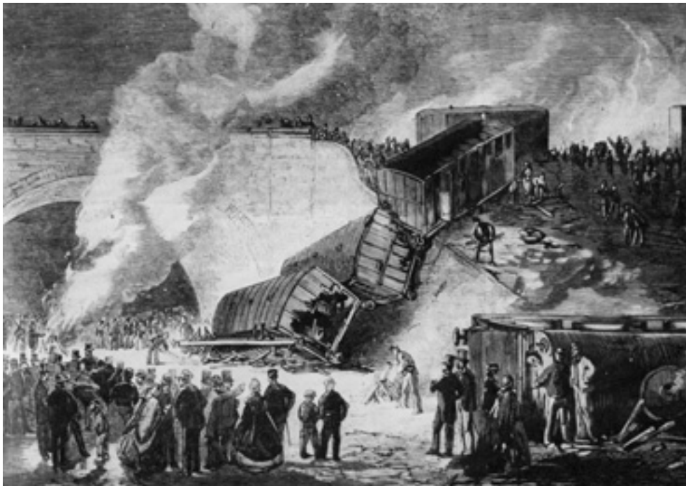
A print of a railway disaster near London in 1861.